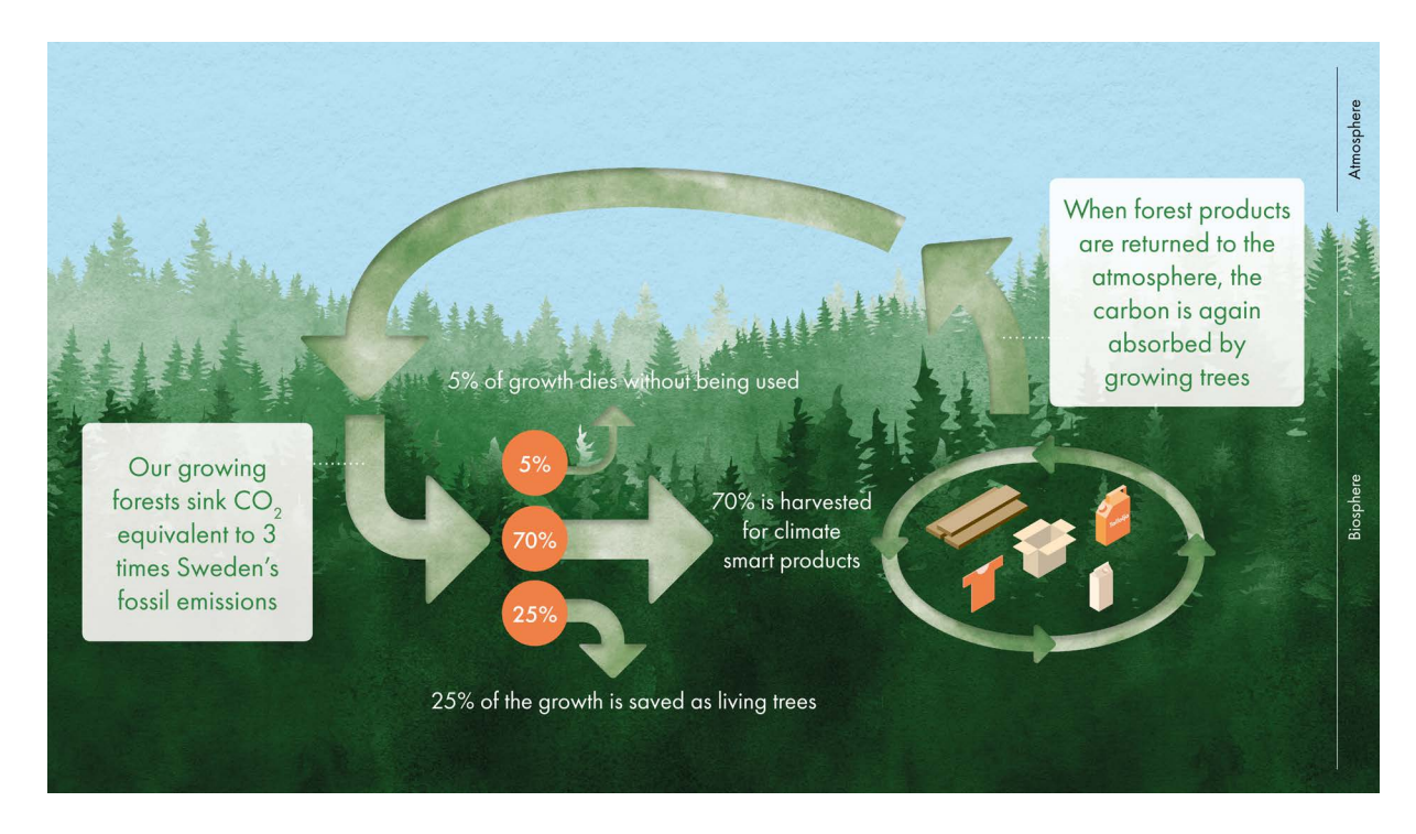
Figure 2. The circular biogenic carbon cycle lays the foundation for climate-smart products from the Swedish forest.